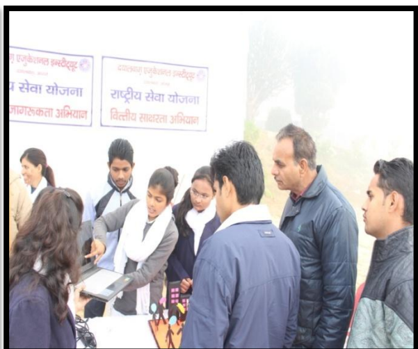
Awareness of Local People