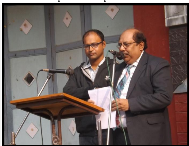
Expert's Invited Talk