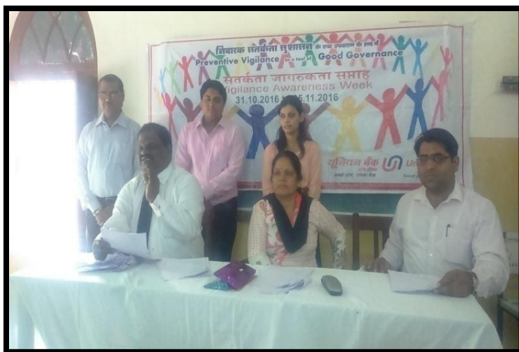
NSS Team and Officials of Union Bank of India in Quiz Competition

The NSS Cell of the Institute organized Vigilance Awareness Week during 31 October – 5 November 2016. On this occasion NSS Volunteers of the Institute participated in "Citizen Integrity Pledge Ceremony" organized on 3 November 2016 in various Faculties after morning assembly. On 5 November 2016 the NSS Wing of the Institute in association with Union Bank of India also organized Quiz Competition for NSS Volunteers on Vigilance Awareness.