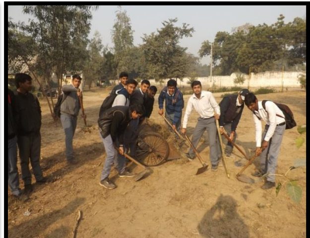
Community Harvesting-Leveling of Fields