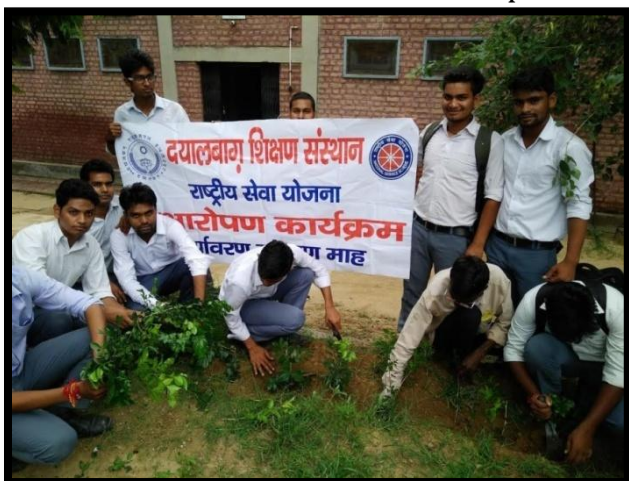
Plantation in Campus