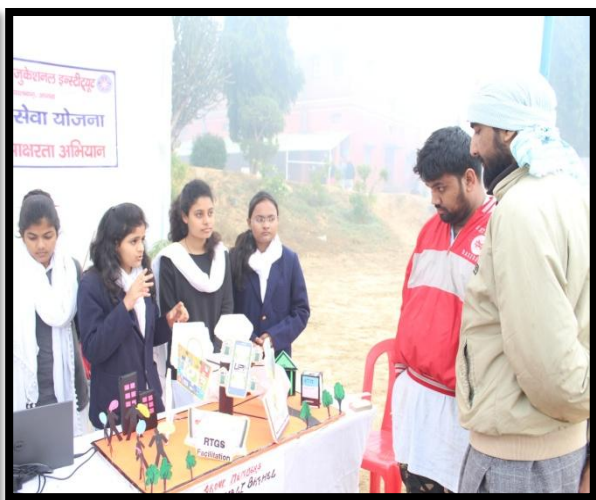
Awareness Program through Models