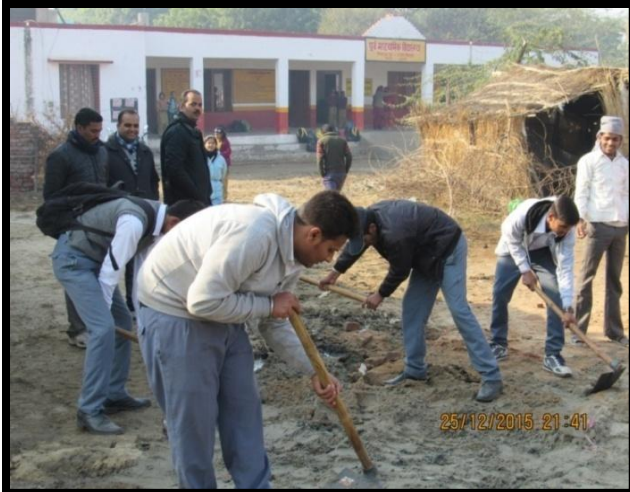
Cleaning of School Campus in Sikander Pur