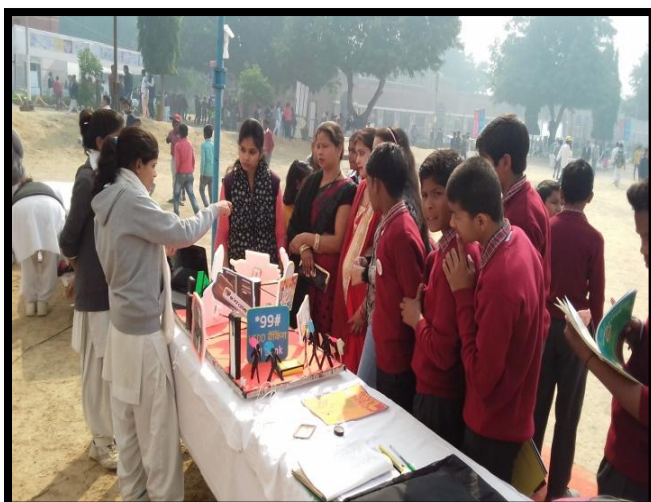
Awareness of School Children through Models