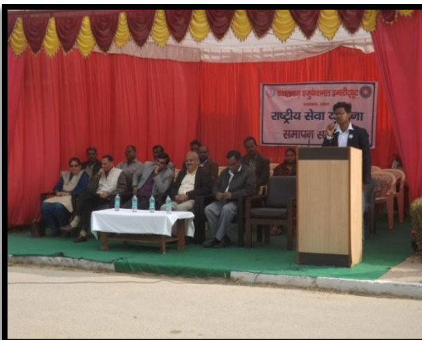
Experience Sharing by Volunteers