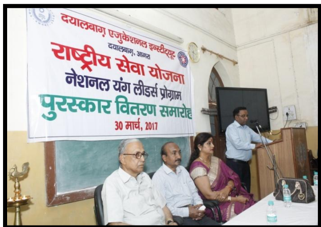
Introductory Theme of NYLP by Coordinator