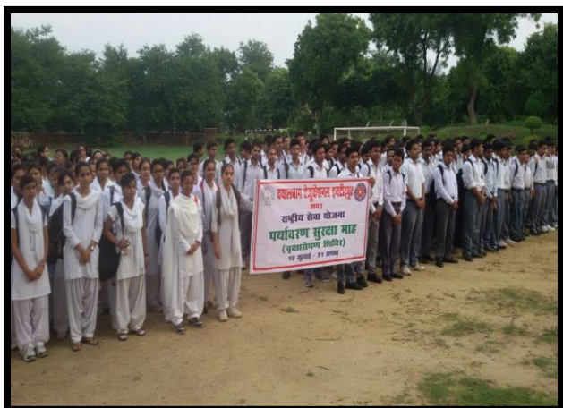
Enronment Protection Sankalp