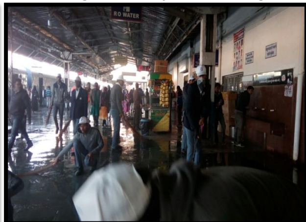
Cleanling of Agra Cantt. Railway Station