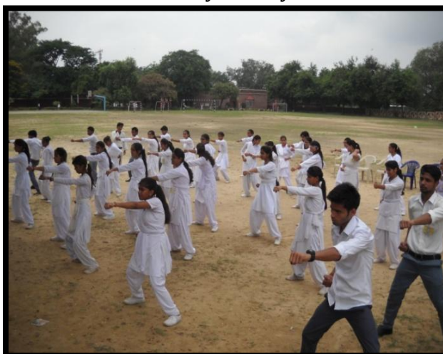
Martial Art Practice