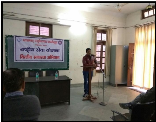
Invited Talk on Digital Financial Literacy