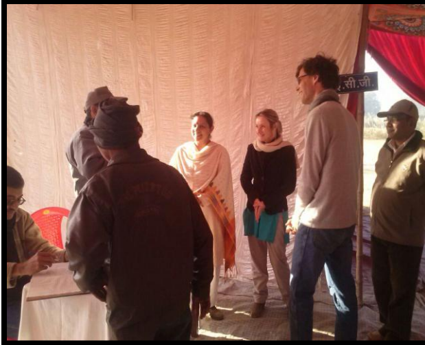
German Psychologists' Visit of FMAC