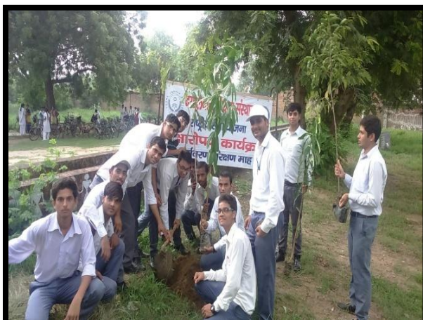
Plantation in Nearby Areas