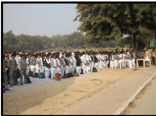
Campers in Valedictory Function