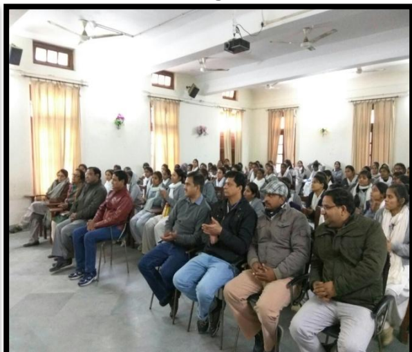
Students & Staff in Invited Talk