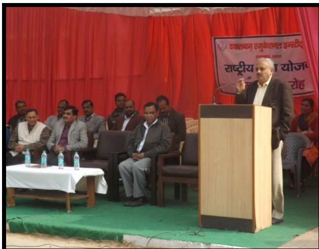
Address by Director of the Institute