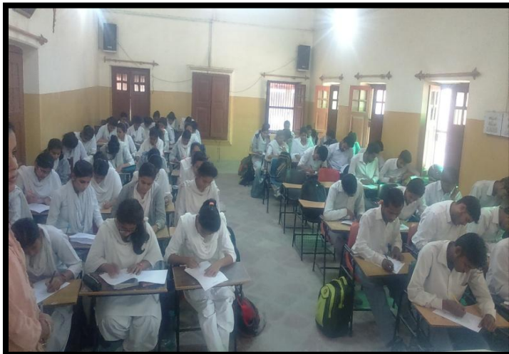
Inter-faculty Poster and Slogan Writing Competition

World AIDS Day was observed on 1st December, 2016. On this occasion NSS volunteers participated in Discussion Program and Inter-faculty Poster and Slogan Writing Competition on “Causes, Effects and Precautions to Control AIDS”.