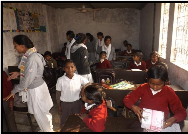
Literacy Campaign in School Campus