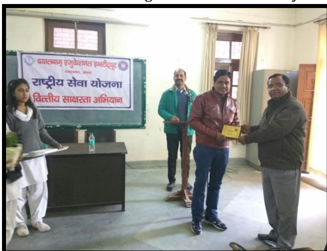
Honor of Invited Speaker by NSS Coordinator