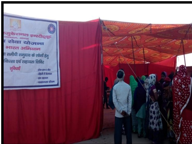
Queue in Medical & Assistance Camp