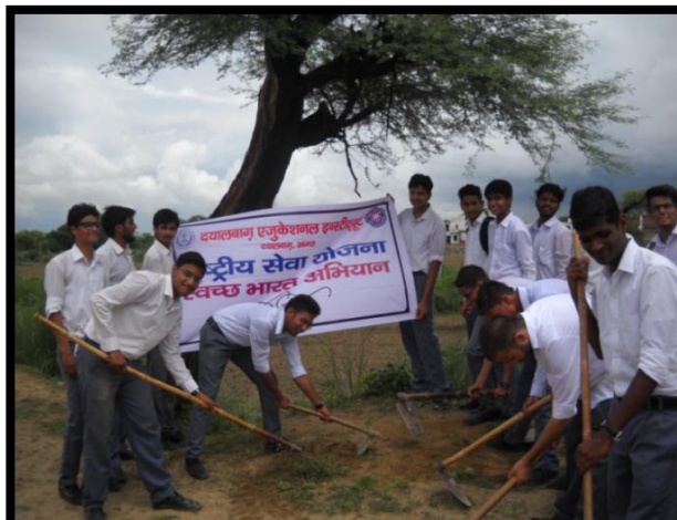
Cleaning of Nearby Areas