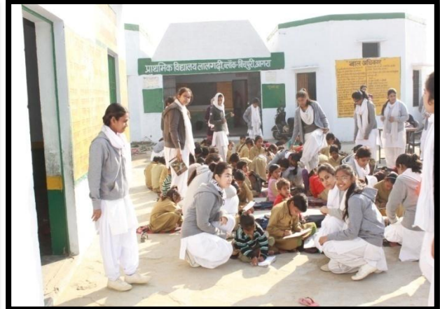
Hyegine Training in School Campus