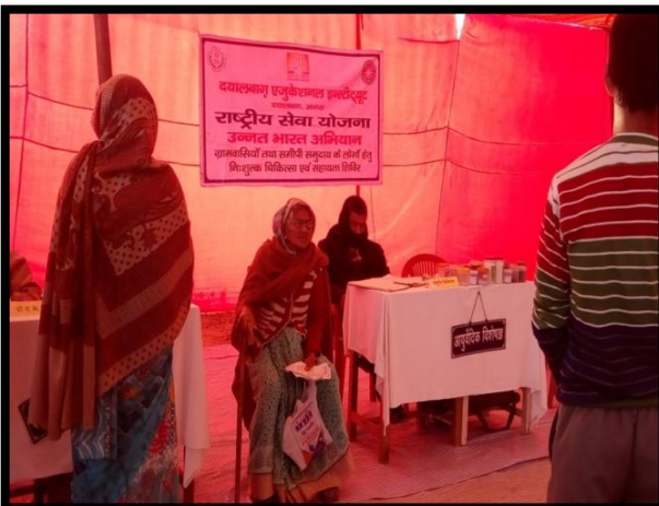
Heart Specialist's Services