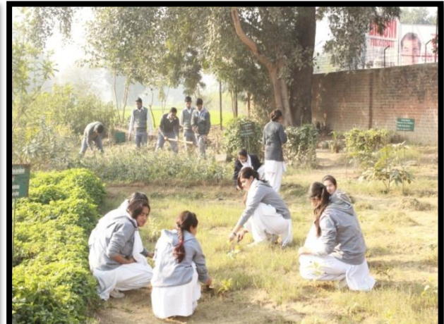
Cleaning in Community Land