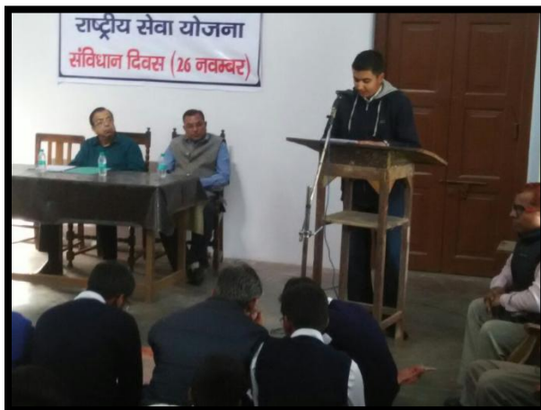
Inter-faculty Speech Competition on Constitution Day