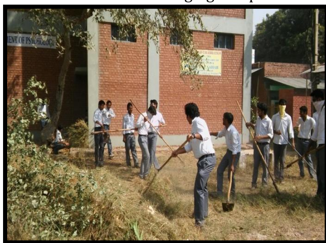
Plantation inside Campus