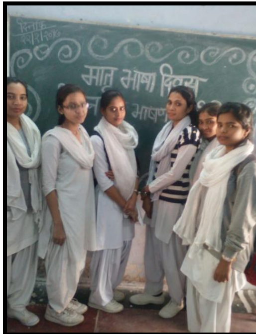
NSS Activities on Matribhasha Diwas