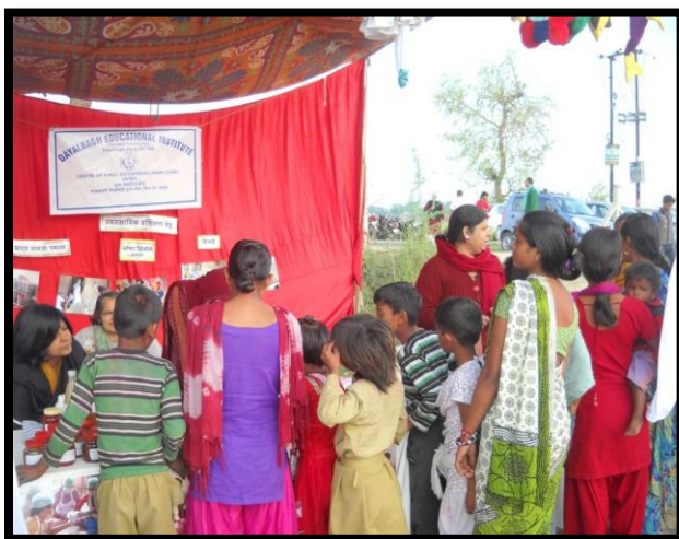
Exhibition-cum-Registration for Skill Development Programs

On this day, registration of willing Urban/ Rural Housewives and School Dropout was made for Short -Term Skill Development / Self Employment Program on Tailoring, Knitting, Soft Toys Making, Textile Printing, Handmade Decorative Items, Pickle and Jam Making, and use of Waste Material offered by the Institute. The Volunteers and Staff made Rural and Urban Women residing in Slums aware about Self-employment Schemes of the Government of India for Women.