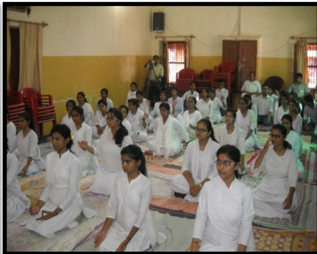
Yoga Practice by Students