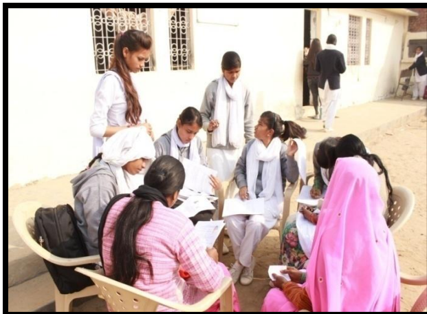
Vocational Training to Housewives