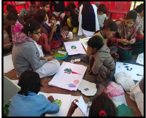
Children Recreation Services