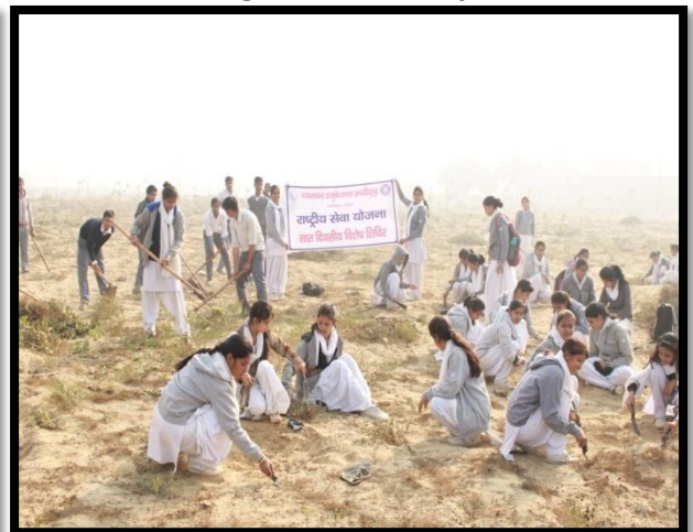
Plant Cleaning & Maintenance