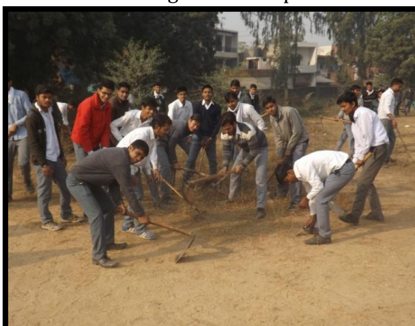
Cleaning in Adopted Areas