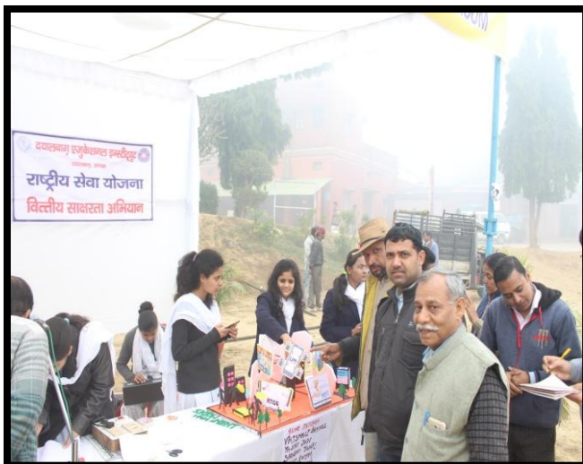
Awareness of Visitors in Founder's Day