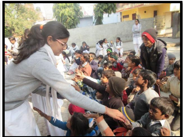
Recreation Services in Adopted Slums