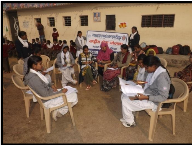
Discussion Program on Social Issues