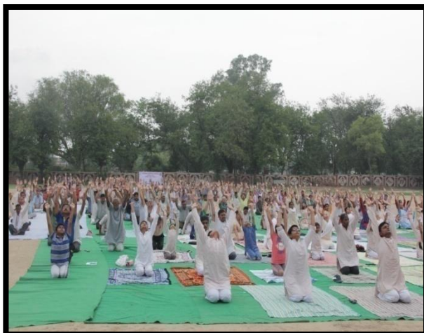
Yoga Practice by Students and Staff