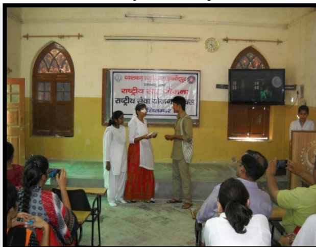
Inter-faculty Skit Competition