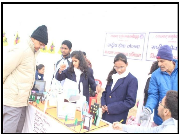
Exhibition-cum-Awareness Program on Founder's Day