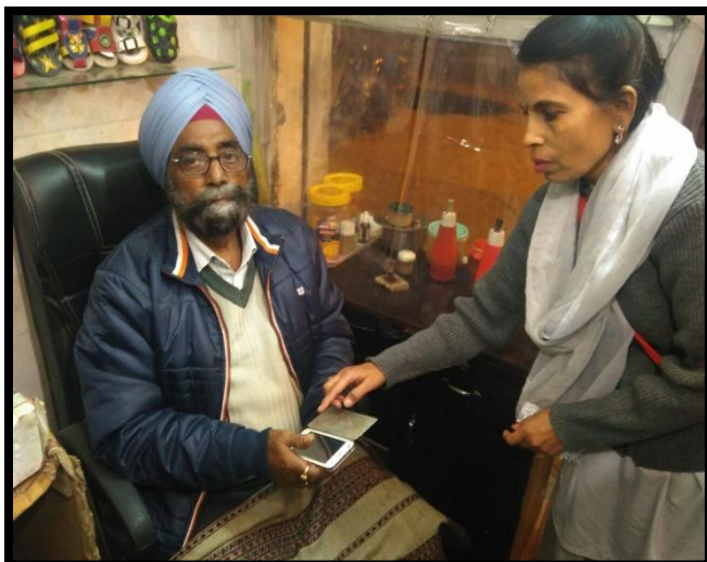
Awareness Among Vendors in Nearby Areas