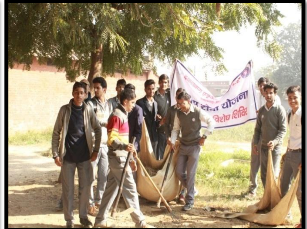
Cleaning in Adopted Villages