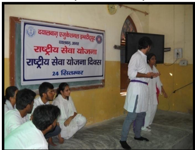
Inter-faculty Skit Competition