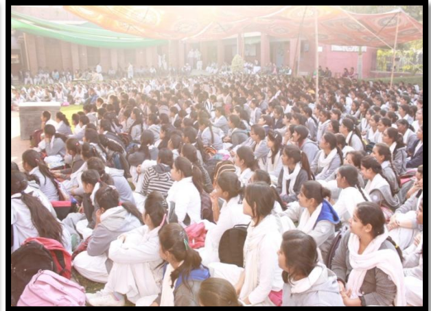
Campers in Afternoon Session