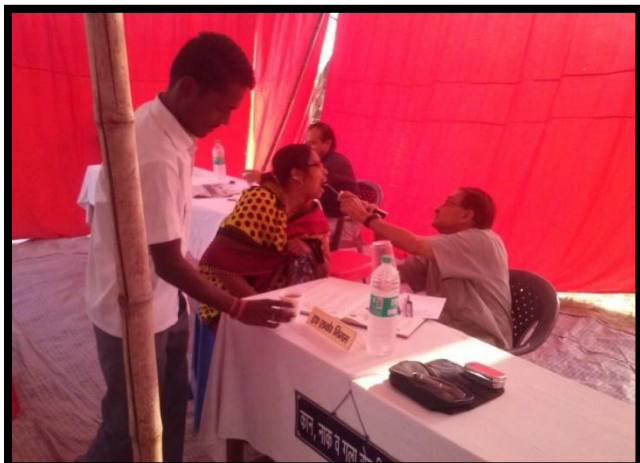
ENT Specialist's Services