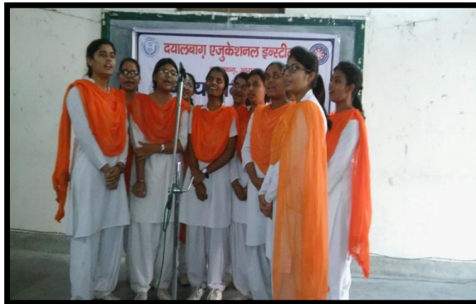
Inter-faculty Group Song Competition