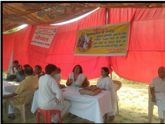
Choupal: Bhagvad Geeta Ke Updesh