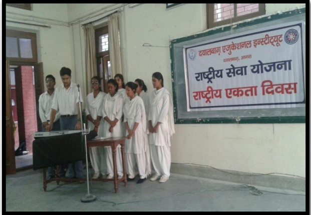
Inter-faculty Group Song Competition