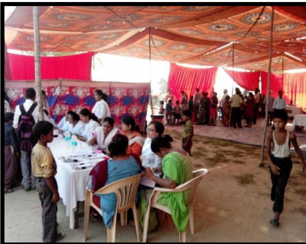
Registration in Medical & Assistance Camp