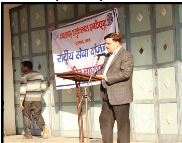
Expert's Invited Talk