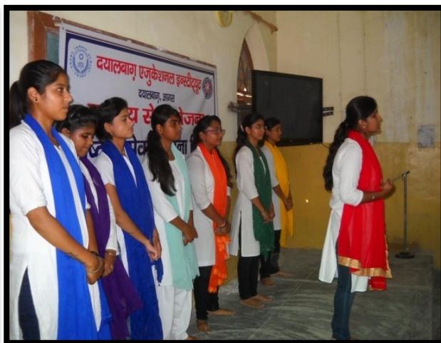
Inter-faculty Skit Competition