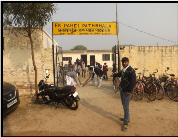
Cleaning at Ek Pahel Pathshala (NGO)