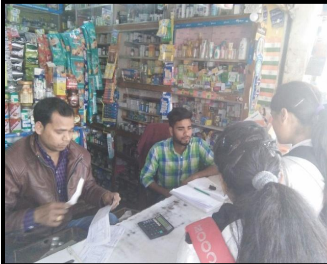
Awareness Among Shopkeepers in Slums