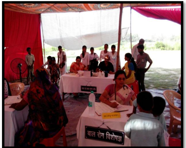
Child Specialist's Services & Pathology