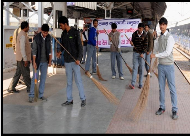
Cleanling of Agra Cantt. Railway Station