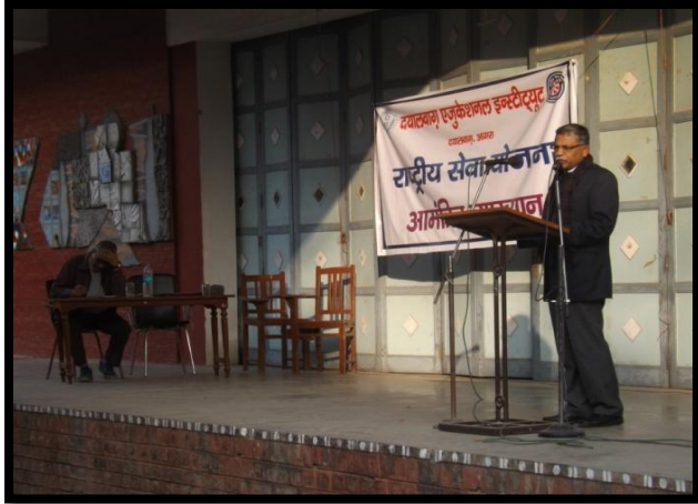
Expert's Invited Talk