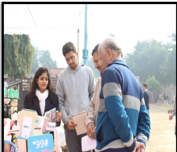
Awareness of Visitors in Founder's Day