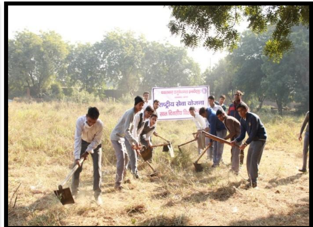
Cleaning Community Land in Village