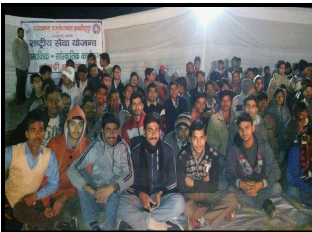
Students & Community People in the Program