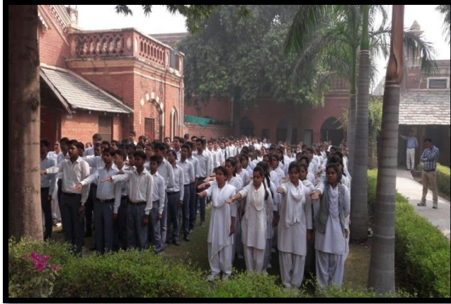
Unity Day Oath Ceremony

National Unity Day was observed on 31st October 2016 on the Birth Anniversary of Sardar Vallabh Bhai Patel. On this occasion, the NSS Volunteers, Students and Staff enthusiastically participated in National Unity Oath Ceremony organized in various faculties by the NSS Wing of the Institute. In the evening session, NSS Volunteers of various faculties participated in Inter-faculty Group Song Competition organized in Faculty of Arts.