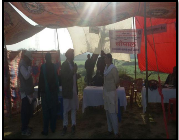
Visit of IARI Scientists