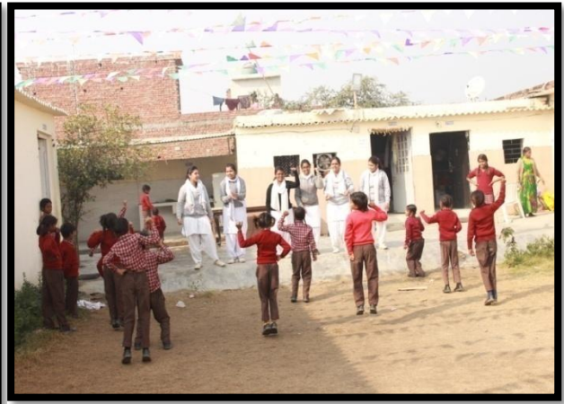
Recreation Services in Ek Pahal (NGO)