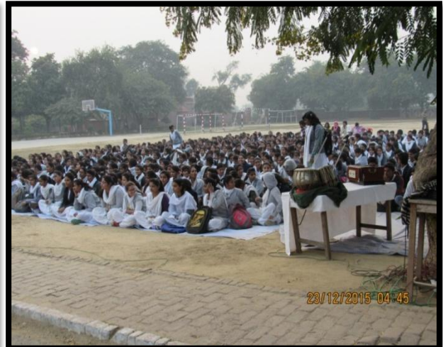
Campers in Camp Inaugural Function