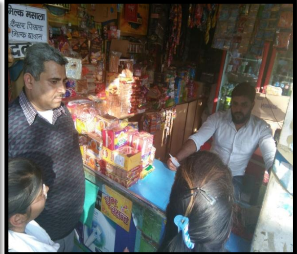
Awareness Among Local Vendors