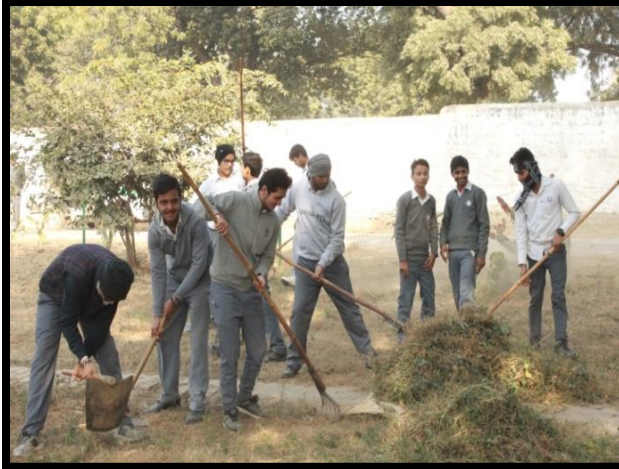
Cleaning in Adopted Villages