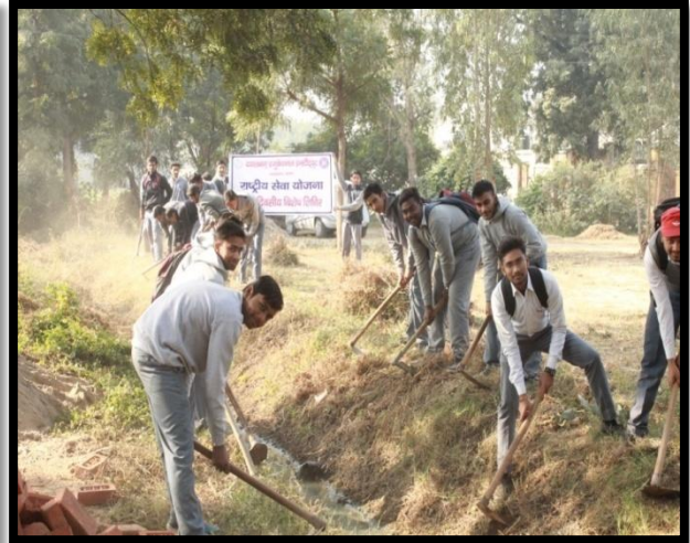
Fencing of School Campus & Minor Work in Adopted Village