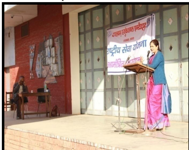
Expert's Invited Talk