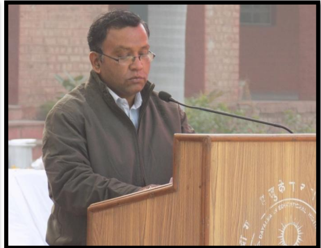
Address by Coordinator, NSS