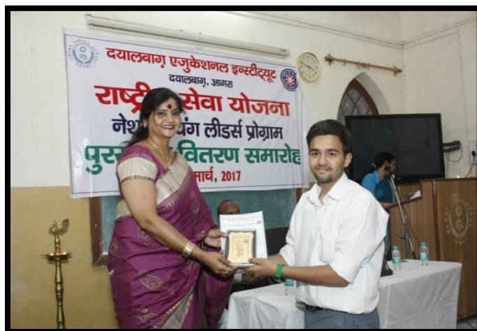
Swami Vivekanand Award to Best Volunteer