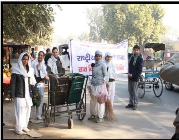
Cleaning on Road Sides