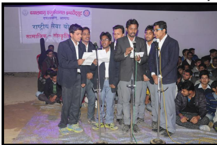
Cultural Program by Students