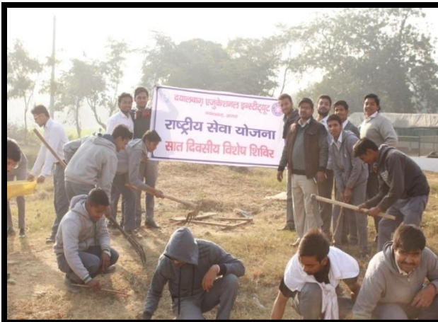
Cleaning Community Land in Village