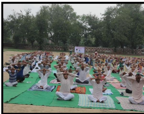
Participants practicing Yoga