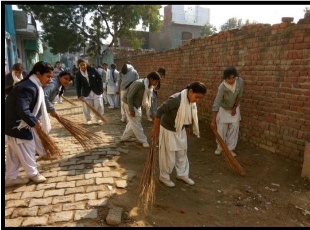
Cleaning in Adopted Slums