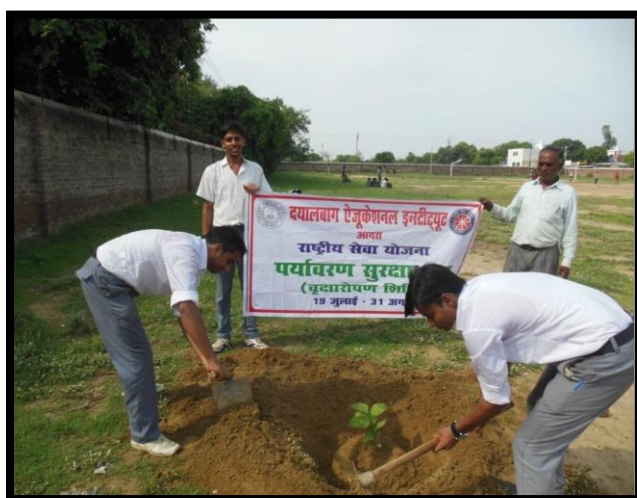
Plantation Surrounding Campus

The NSS Cell of the Institute organized One Day NSS Camps on different dates involving NSS Volunteers of different faculties. The activities conducted/ tasks performed in these camps included (i) Intensive cleaning of Campus and Surroundings, (ii) Cleaning of Roadsides and Medical Camp Venue, (iii) Plantation in Environment Protection Month, (iv) Maintenance of Plants, (v) Free Medical and Rural Assistance Camp for People of Adopted Villages, (vi) Literacy and Recreation Activities for Children of nearby Adopted Villages, (vii) Voters Awareness in nearby Villages/ Localities, (viii) Awareness on E-payment in nearby Villages/ Localities, (ix) Rural Assistance and Chaupal, (x) Vocational Training to Youth for youth of nearby Villages and Slums, (xi) Awareness Program on Agriculture Issues and Benefits of Community Agriculture, (xii) Participation in Community Harvesting