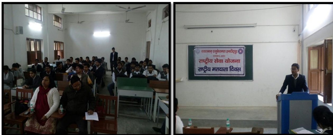
Inter-faculty Speech Competition

On this occasion, in the evening session of 23rd January 2017, an Inter-faculty Essay Writing Competition and also a Speech Competition on the topic “My Vote Does Not Matter” was organized. On 25th January 2017, after Morning Assembly, the NSS Cell of the Institute Organized Voters Oath Ceremony for all Students and Staff of the Institute.