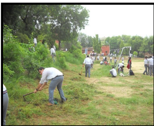
Cleaning in the Campus