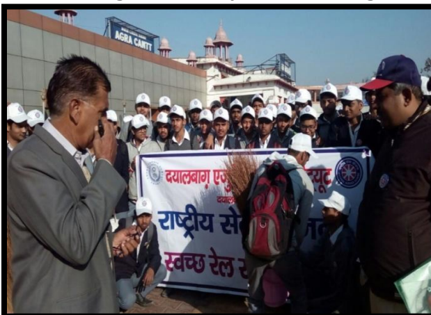
Cleanliness Campaign at Agra Cantt. Station