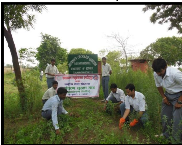
Plantation in Botanical Garden of the Institute