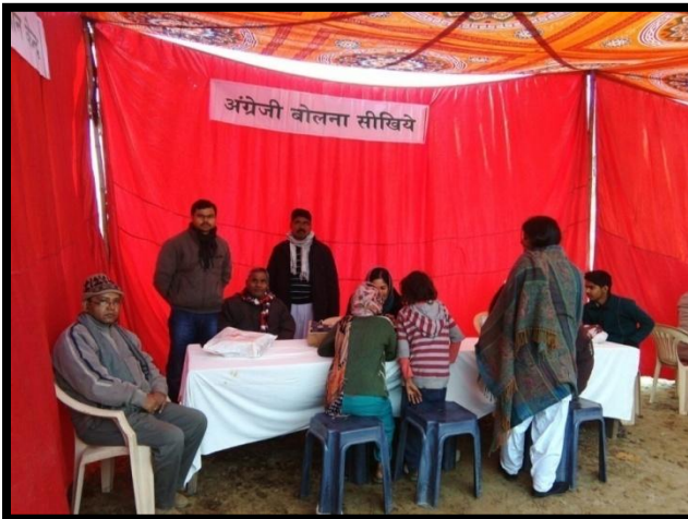
English Speaking Services