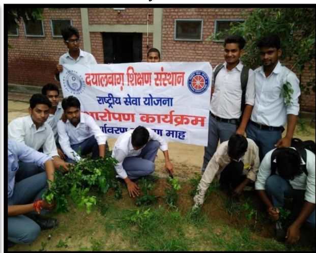
Plantation and Shramdaan