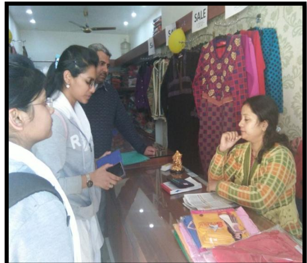
Awareness Among Women Entrepreneurs