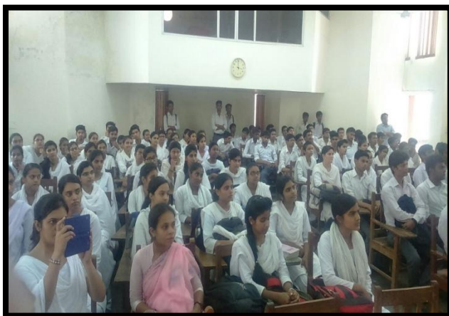
Students & Staff in the Program