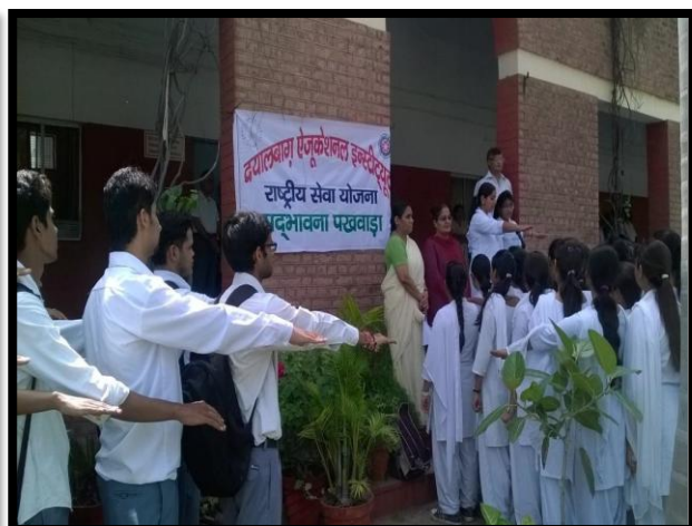
Sadbhavna Day Oath Ceremony