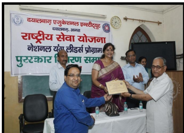
NYLP Award to Best NSS Unit