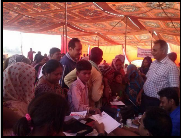
Visit of NSS Regional Director