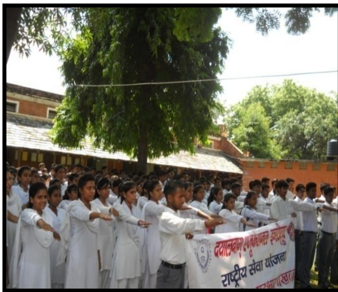
Sadbhavna Day Pledge Ceremony

In the evening session NSS Volunteers of various faculties participated in Poster/ Slogan Competition on the topic Communal Harmony.