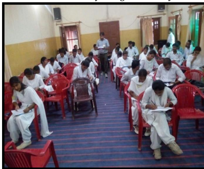
Poster/ Slogan Writing Competition