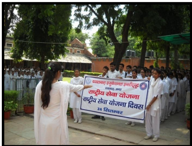
NSS Day Oath Ceremony

NSS day was observed on 24 September 2016 to mark the foundation of National Service Scheme to sensitize youth of the nation about nation building exercises. On this occasion, Oath Ceremony was organized by all faculties of the Institute during the morning assembly. In afternoon session, NSS Unit of the Institute organized an Inter-faculty Skit Competition on various social issues.