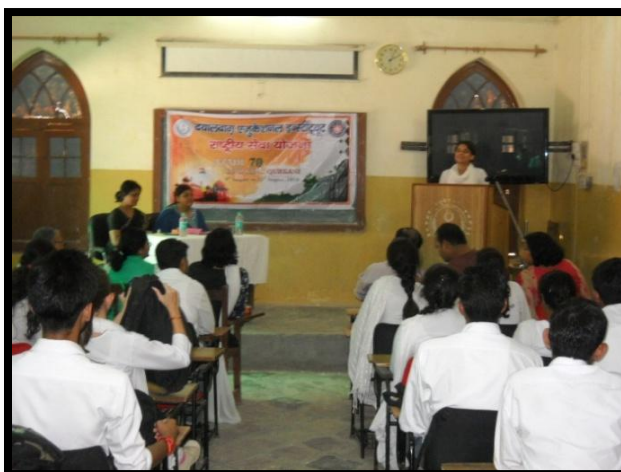
Inter-faculty Speech Competition