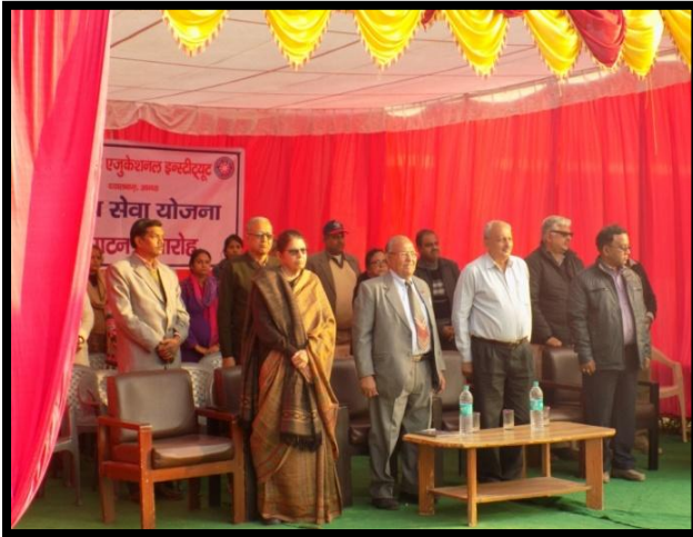
Inaugural Function of 7 Day Special Camp