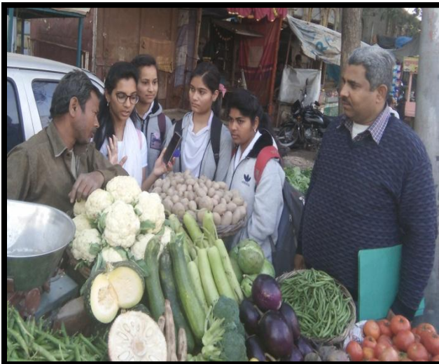
Awareness Among Street Sellers

Our initiative under the umbrella of VISAKA soon became a media perpetuated program and was largely appreciated by the local newspapers and news channels. A number of NGOs, viz., Ek Pahal, India Rising and others are regularly welcoming students of DEI and appreciating their efforts towards social developments, particularly VISAKA initiative.