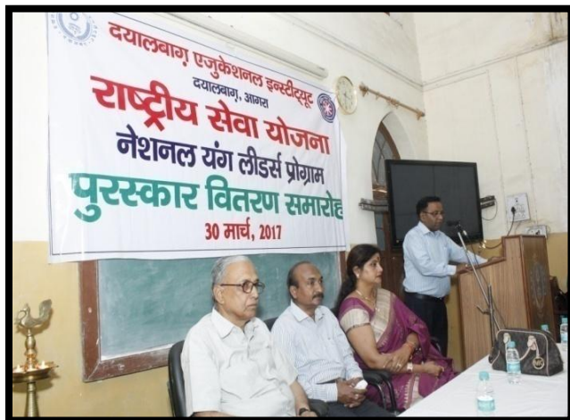
Address by Coordinator, NSS at NYLP Function

For Outstanding contribution in Social/ Community Service by the NSS Cell of the Institute, Ministry of Ministry of Youth Affairs & Sports honored NSS Unit of the Institute by National Young Leaders Award under National Young Leaders Program (NYLP). The Regional Directorate (NSS), Lucknow granted Rs. 65000 as reward money under NYLP.