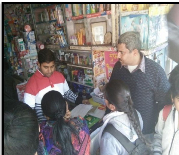
Awareness Among Local Vendors